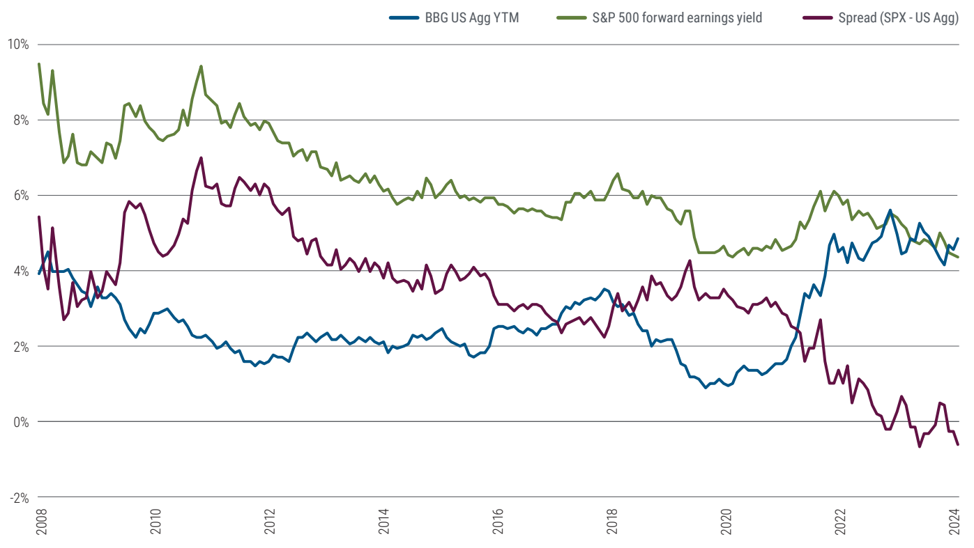
Figure 3: Bond yields have risen above S&P earnings yield

Bond market yields based on Bloomberg US Aggregate Index. SPX is the S&P 500.