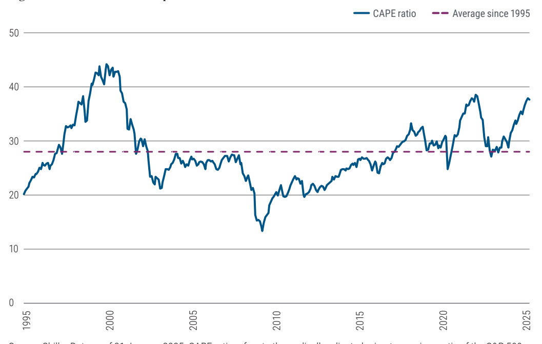
Figure 1: CAPE ratio is near peak levels

Source: Shiller Data as of 31 January 2025. CAPE ratio refers to the cyclically adjusted price-to-earnings ratio of the S&P 500.