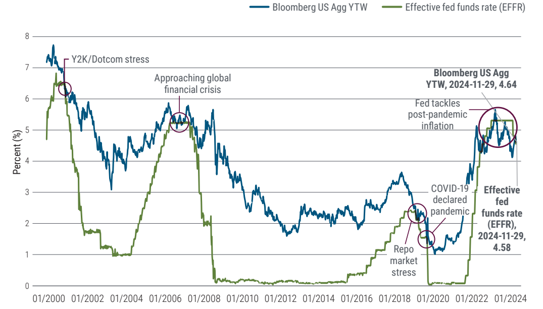
Figure 1: Benchmark bond index yield once again exceeds Fed's policy rate

Data shown are the Bloomberg US Aggregate Index yield to worst (LBUSYW) and the effective fed funds rate (EFFR).